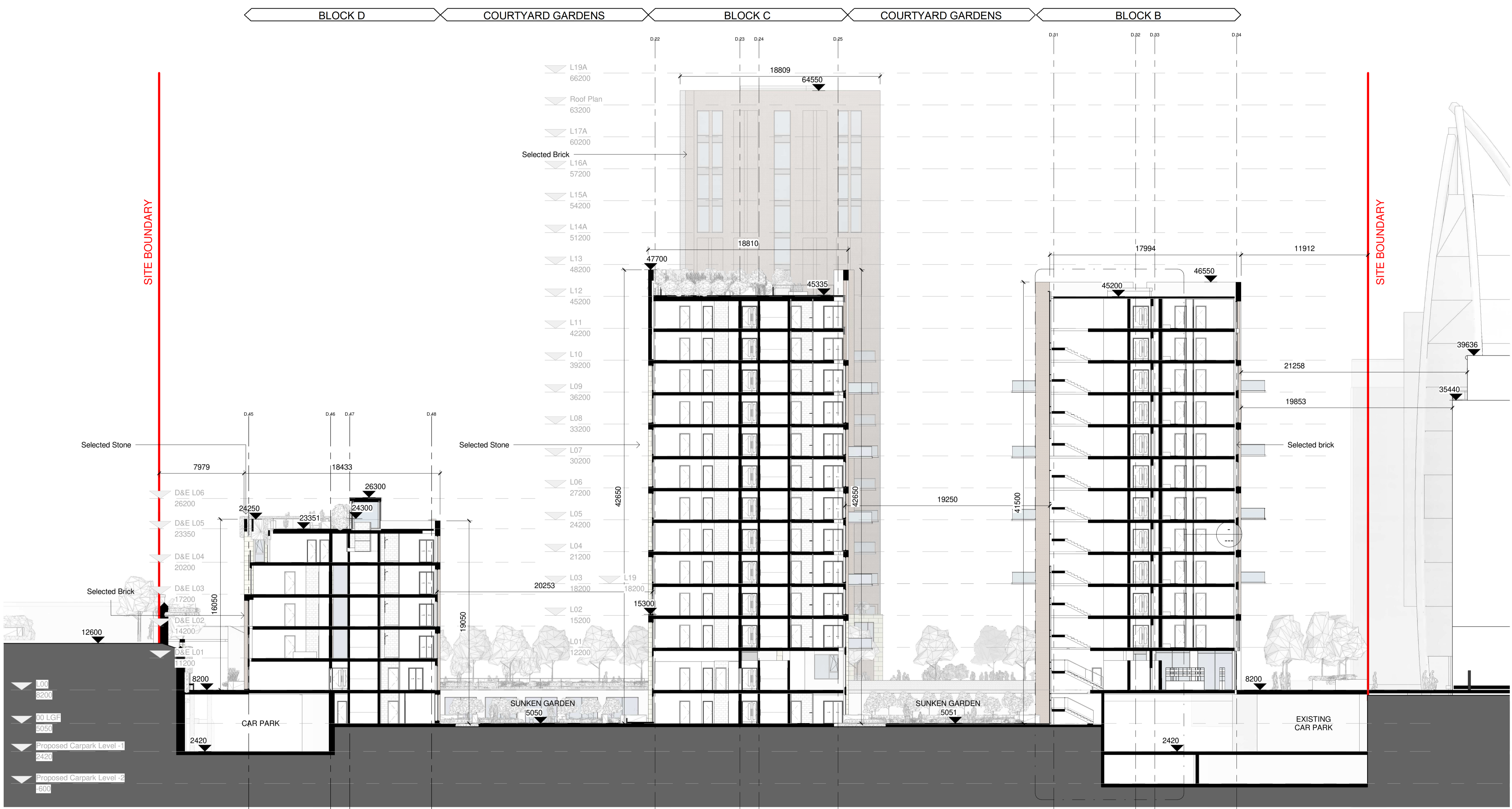
Proposed Section 04 1 : 200